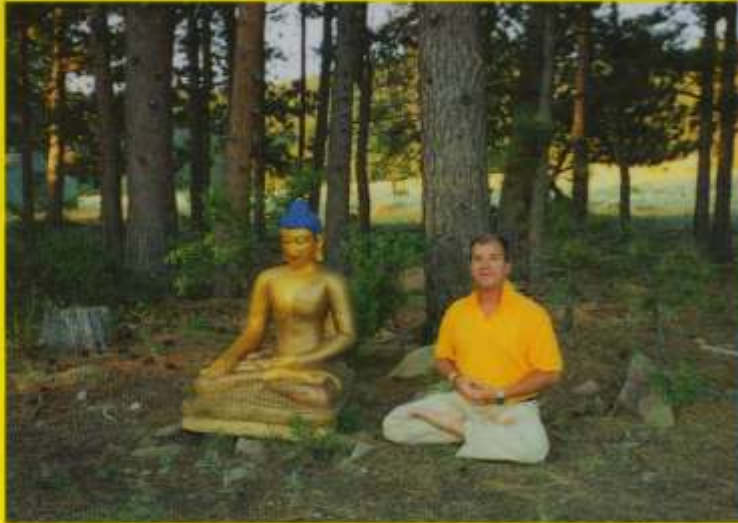
The author at a retreat center next to a statue of Buddha

Meditation and the teachings of The Buddha have become increasingly popular in this modern-scientific-information age. People from all walks of life have found meditation and the Buddha's teachings helpful for overall health, relaxation, and wisdom. The Buddha's core teaching is in the Eightfold Middle Path and the many other lists of The Buddha. The author guides us through this time-less teaching by explaining the meanings and steps. A total of 90 lists are presented in this book with 29 of the most important ones explained in detail, including the four evolutionary stages of religion in the Foreword.